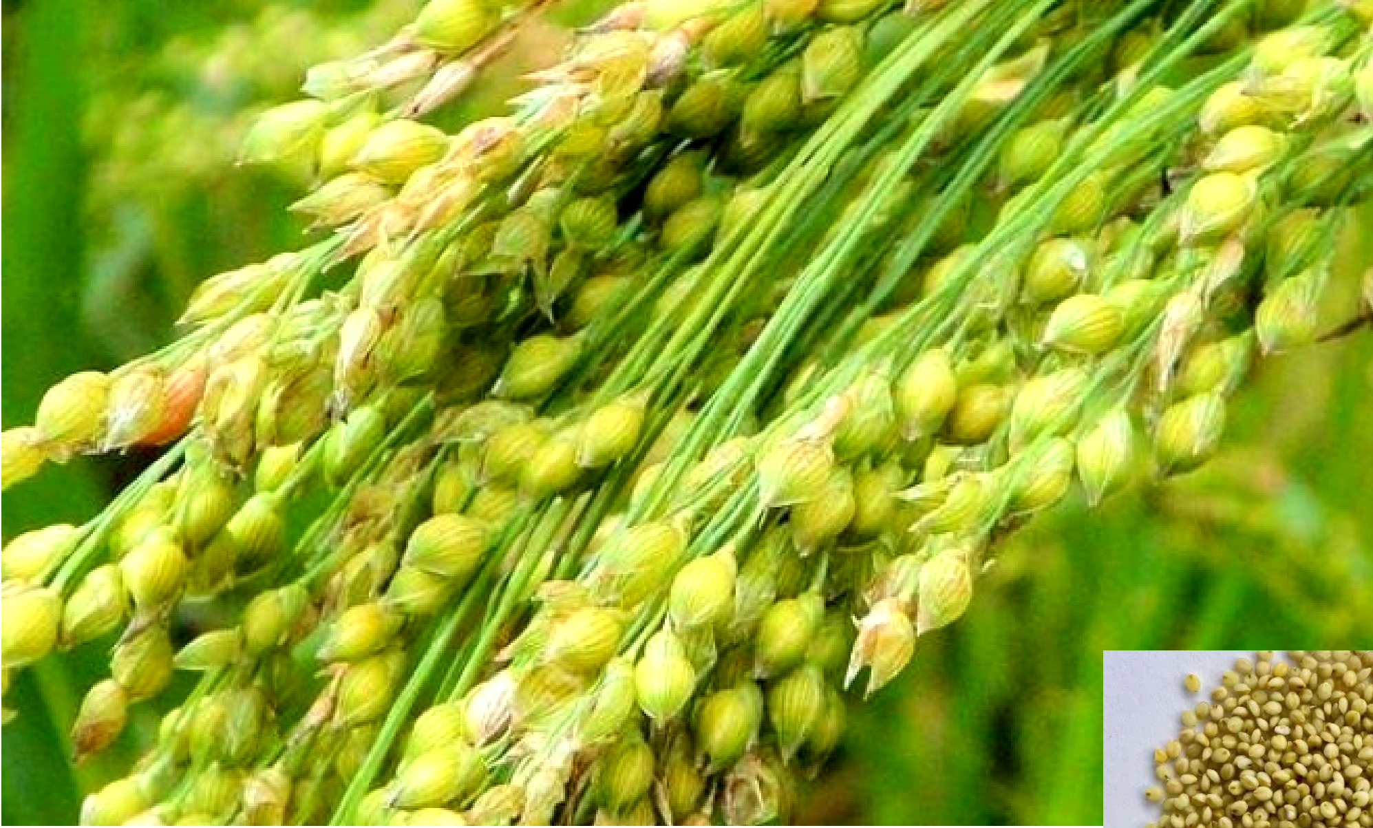
BROWNTOP MILLET मक्रा/मुरात

A good source of zinc, iron and fibre; per 100g: Energy-338 Kcal, Protein-11.5 g, Fat-1.89 g, Carbohydrate-71.3 g, Ca-0.01 mg, Fe- 0.65 mg. Cultivation: Karnataka and Andhra Pradesh