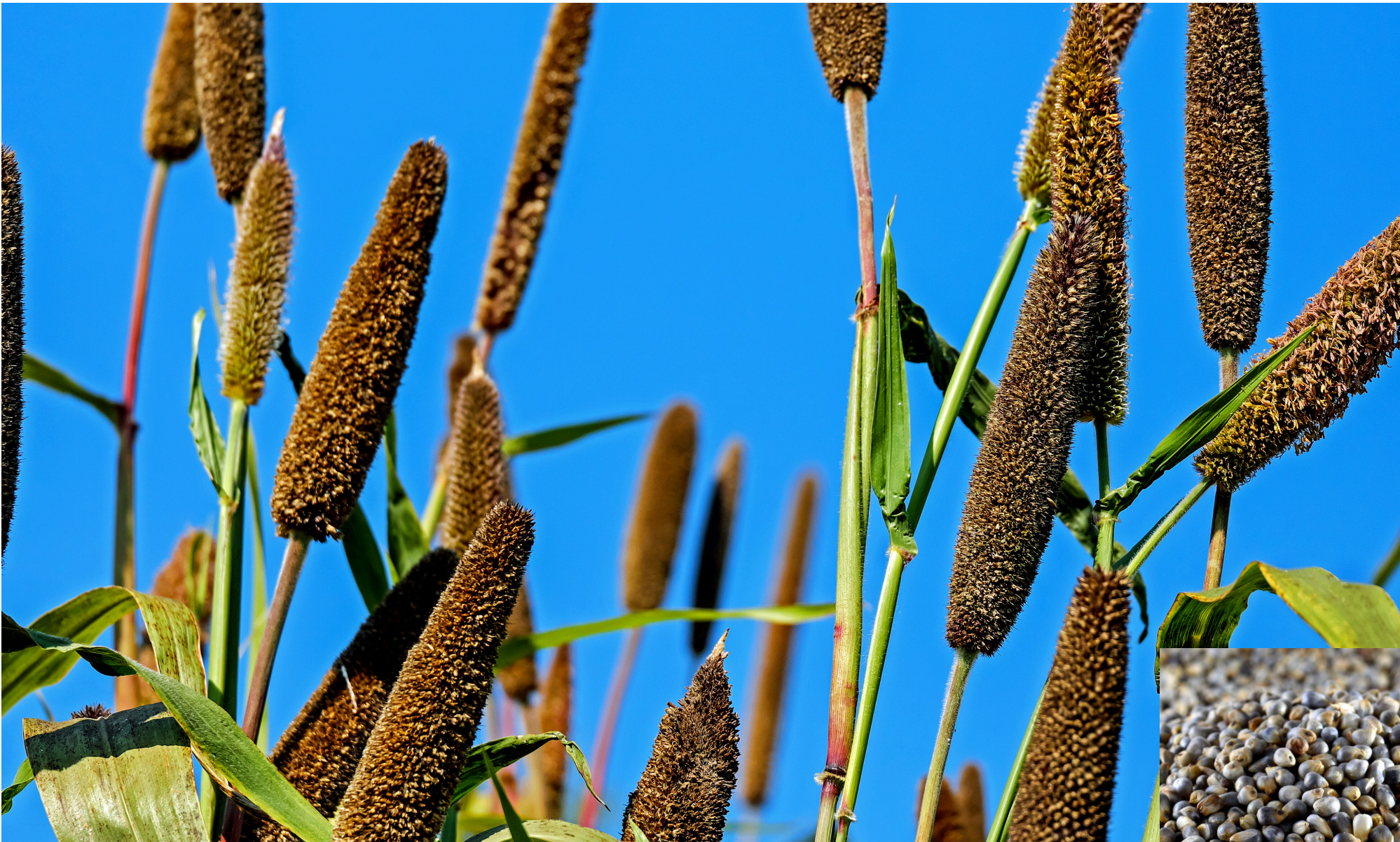
PEARL MILLET बाजरा

Highest niacin content amongst all cereals; rich in protein, lipids and dietary fiber; per 100g: Energy-347 Kcal, Protein-10.9 g, Fat-5.43 g, Carbohydrate-61.8 g, Ca-27.4 mg, Fe- 6.4 mg, Folic Acid- 36.1 µg Cultivation areas: Rajasthan Maharashtra, Gujarat, Uttar Pradesh and Haryana