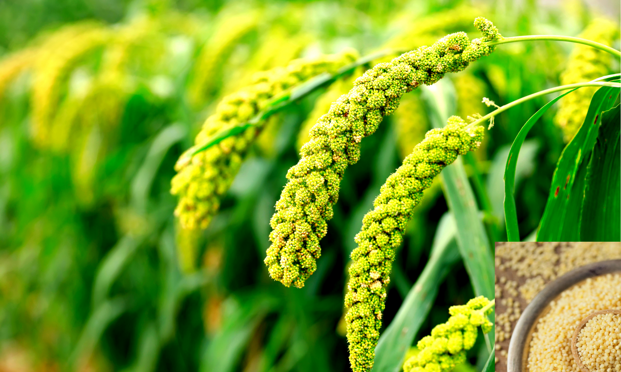
FOXTAIL MILLET कंगनी/दांगुन