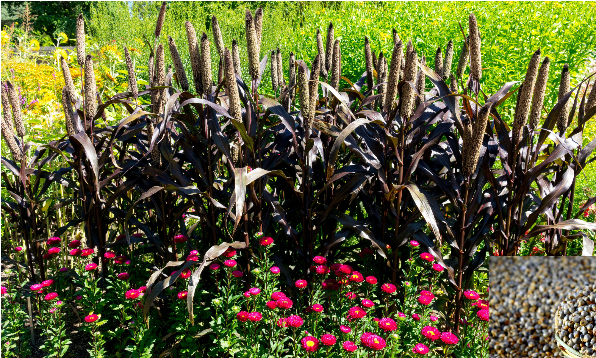
PEARL MILLET बाजरा

Highest niacin content amongst all cereals; rich in protein, lipids and dietary fiber; per 100g: Energy-347 Kcal, Protein-10.9 g, Fat-5.43 g, Carbohydrate-61.8 g, Ca-27.4 mg, Fe- 6.4 mg, Folic Acid- 36.1 µg Cultivation areas: Rajasthan Maharashtra, Gujarat, Uttar Pradesh and Haryana